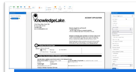
Real-time natural language queries during document review

Streamlining the process of student enrollment for universities and colleges with digital document management, automated workflows, and integration with student information systems can enhance efficiency, compliance, and the overall enrollment experience.